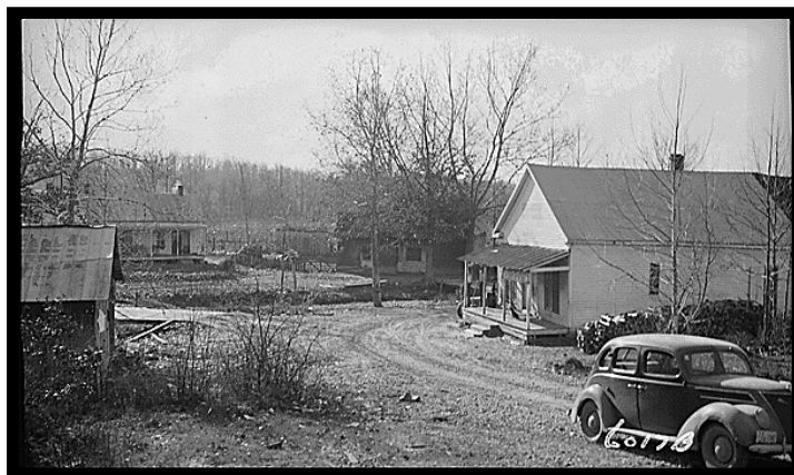
M.T. Watkins store in Lime Works Community